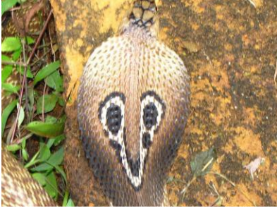
(cropped) ii

Rikki-tikki felt his eyes growing red and hot (when a mongoose's eyes grow red, he is angry). He looked all around him, but Nag and Nagaina had disappeared into the grass. Rikki-tikki did not follow them because he wasn't sure that he could kill two snakes at once. So he sat down to think. It was a serious matter 10 for him.