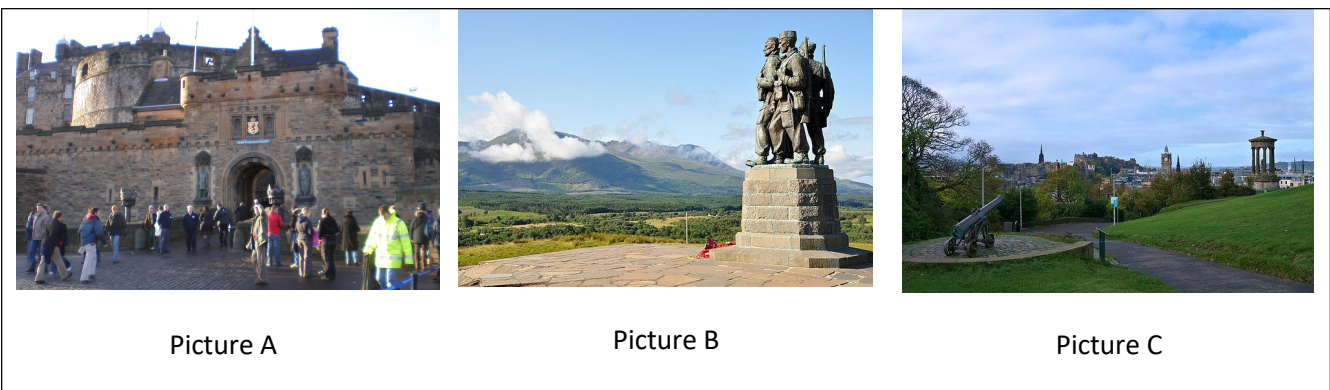
Chris Sherlock (Ta bu shi da yu), CC BY-SA 3.0 , via Wikimedia Commons